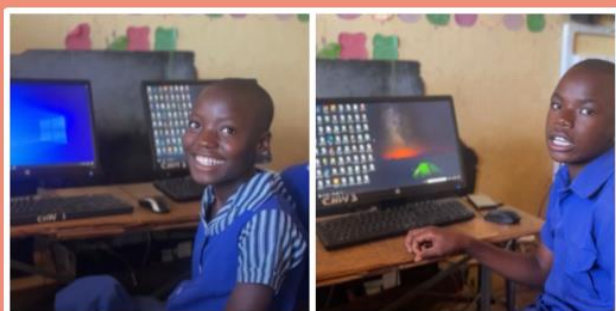
Chiwarira Primary School, Nyanga, Zimbabwe