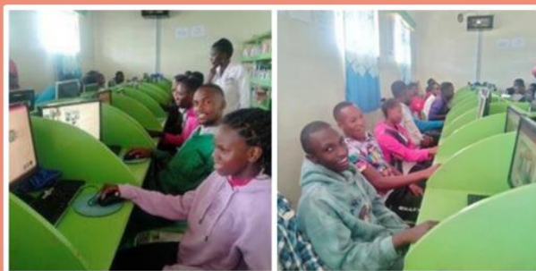
AIC Naivasha Polytechnic, Naivasha, Kenya