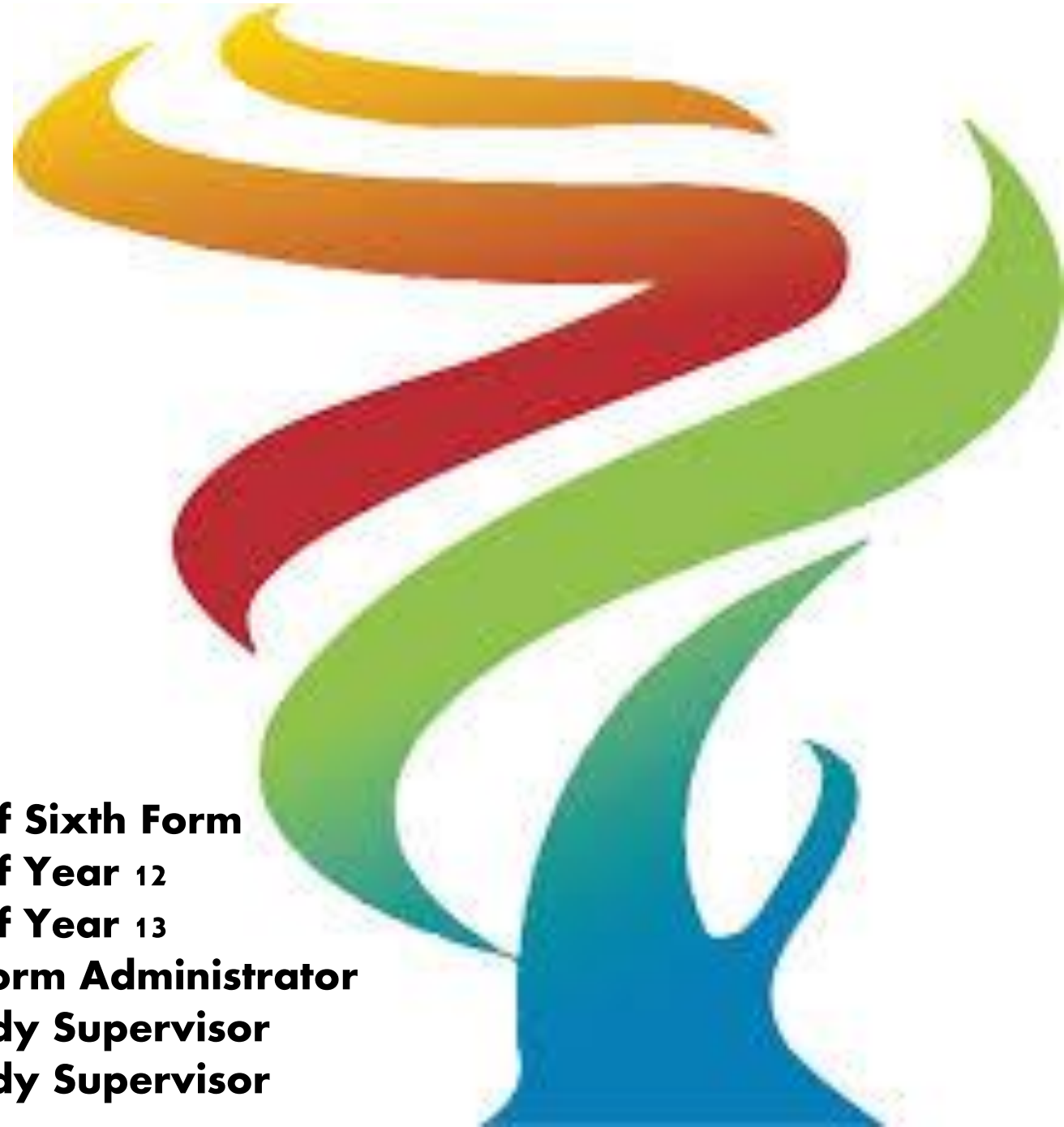
Y13 Study Supervisor