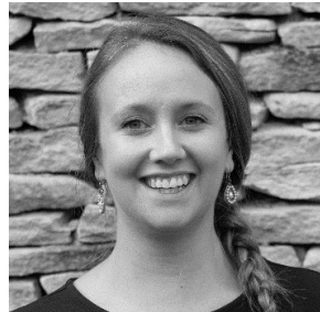
Head of Sixth Form