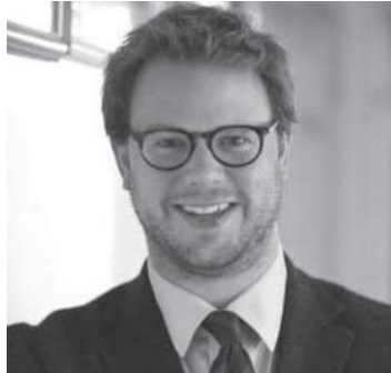
Head of Sixth Form Head of Year 13 Head of Year 12 Sixth Form Administrator